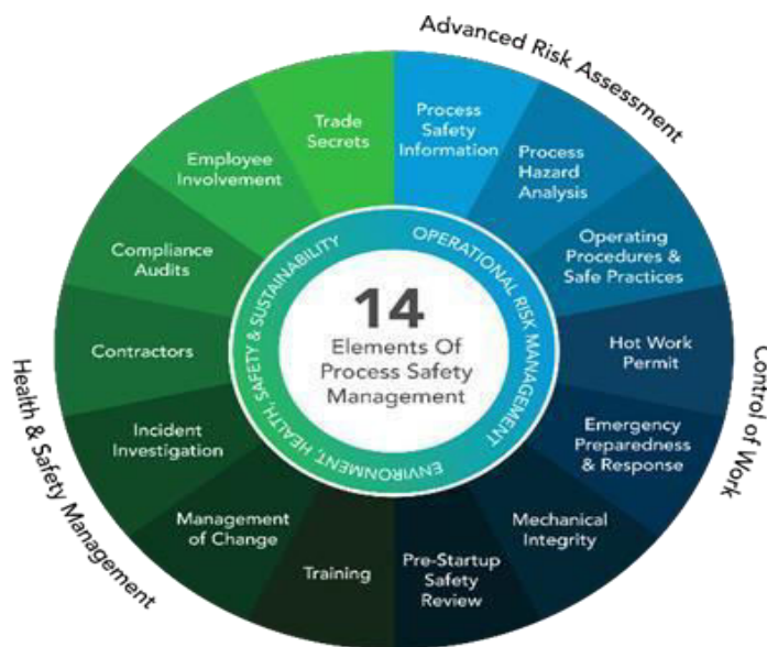
Elements of process and safety

The main purpose of fire safety is to protect human life. This includes safely evacuating buildings in the event of a fire, as well as preventing fires and quickly detecting and extinguishing flames to minimize the risk of injury and death. Fire safety also aims to protect properties, both tangible and intangible. This includes buildings, equipment, materials, documents, data and information, among others. Fire prevention is an important part of fire safety. This includes measures to reduce the risk of fire, such as installing fire detection and alarm systems, fire suppression systems, safe electrical and mechanical systems, and adopting safe workplace practices. In the event of a fire, the goal of fire safety is to limit the damage caused by fire. This includes containing the fire to a specific location, limiting damage to equipment and materials, and reducing the time required to recover operations. Fire safety also aims to maintain continuity of operations during and after a fire. This includes ensuring that businesses can continue to operate normally after a fire, minimizing the impact on operations and the personnel involved. Safety is very important role in safety management in workplace of industries.